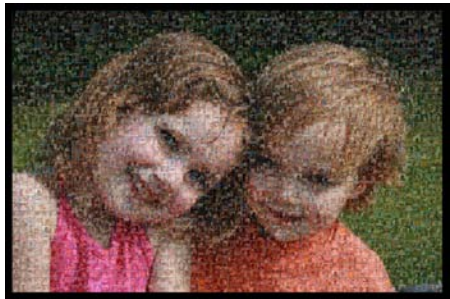
Another happy customer